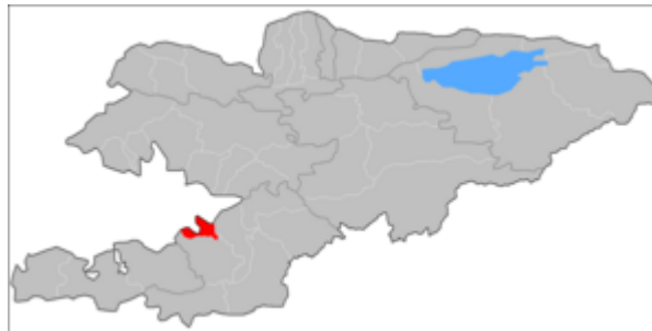
Figure 1. Location of Aravan district

The climate of the district is arid, determined by the presence of semi-deserts in the north of the district. Summers are hot and long, with an average warm period of 236 days and fewer than 10 days with snow cover. The average annual air temperature in July is +28°C, and the average temperature in January is -3°C. The average annual precipitation is 290-300 mm.